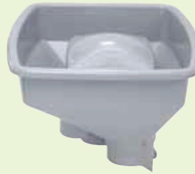
Hopper feed head

An easy solution for making large amounts of top-quality, flavoursome mashed potato.