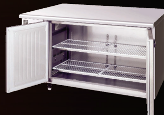
RTC-150SDA-ML RTC-150SNA-ML FTC-150SDA-ML FTC-150SNA-ML