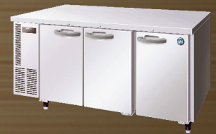
Counter Refrigerator (RTC) / Freezer (FTC)