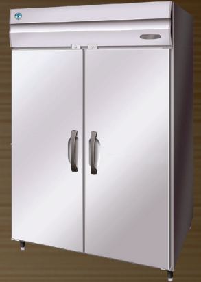
Upright Refrigerator (HRE) / Freezer (HFE)