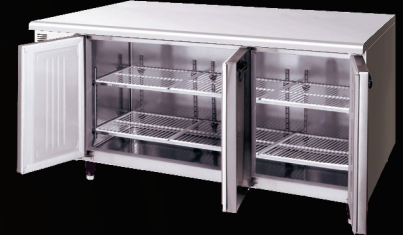
RTC-180SDA-ML RTC-180SNA-ML FTC-180SDA-ML FTC-180SNA-ML