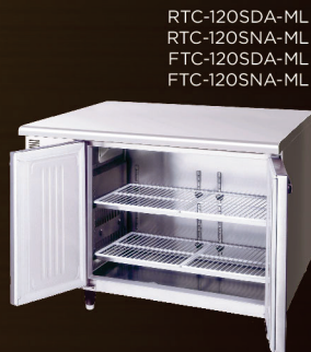
RTC-120SDA-ML RTC-120SNA-ML FTC-120SDA-ML FTC-120SNA-ML