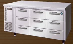
Counter Drawer Refrigerator (RTC) / Freezer (FTC)